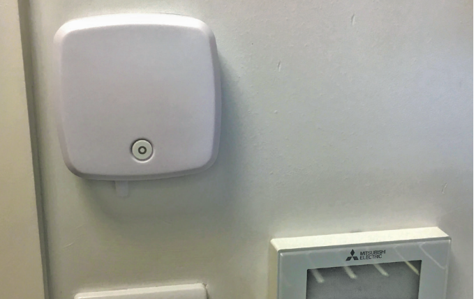
EL-MOTE logger monitoring room temperature (Top Left)

these loggers could utilise their existing WiFi network to send their data to an EasyLog Cloud account. This meant all their critical temperatures, at all of their locations, could be monitored conveniently from one online control panel, and critical temperature alerts could be received via e-mail.