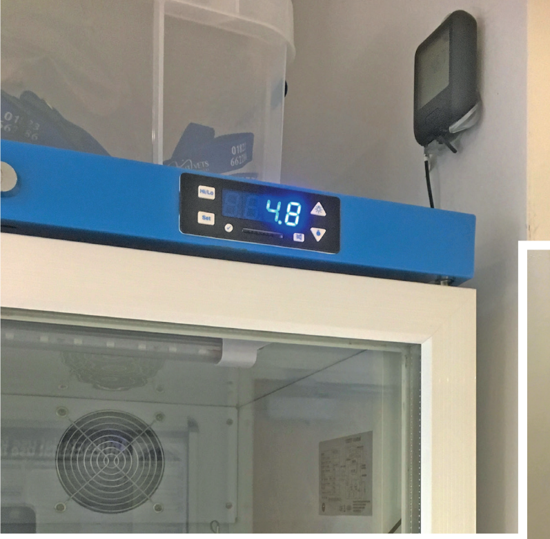
EL-WiFi-TP logger monitoring fridge temperature (Top Right)

Mount Vets was looking for a way to improve its procedures for temperature checks. They had used Lascar's EasyLog USB-1 before, but were now looking for a more automated solution which offered better tracking, data collection and notifications. This would help with meeting the requirements of their Royal College of Veterinary Surgeons (RCVS) inspection, which happens every four years. Devices were